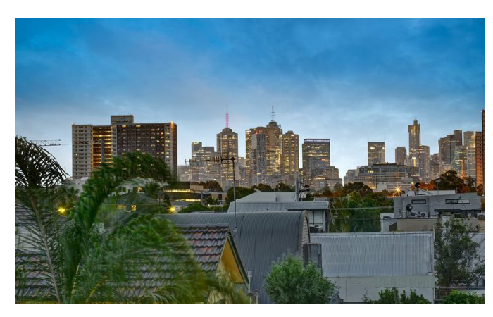
View from penthouse apartment

The development consists of 2 luxury apartments. On the ground floor is a 3-bedroom apartment with 2 bathrooms, spacious living areas, modern kitchen and an alfresco dining area in the courtyard. The penthouse apartment comprises of two storeys of spacious living with 3 bedrooms, 2 bathrooms, modern kitchen, a private elevator from the ground floor, alfresco dining area on the balcony and spectacular city views.